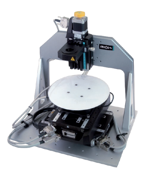
Wafer inspection system with integrated linear motor axes for fast precision XY scanning. Stepper motor axis for fine vertical position of the inspection equipment. Front page: Double-sided wafer inspection system in a flexible 15-axis configuration