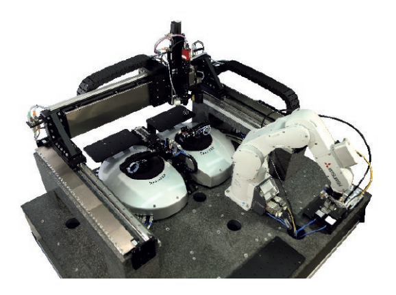
This system for the automated assembly and alignment of the optical fibers on a silicon photonic chip integrates several hardware components and software, such as pick-and-place robot technology, image processing, or devices for precision positioning

18-Axis double alignment system provides fast NxM alignment of SiP devices in wafer probers. Cascade Microtech's pioneering CM300xi photonics-enabled engineering wafer probe station integrates PI's Fast Multichannel Photonics Alignment systems for high throughput, wafer-safe, nano-precision optical probing of on-wafer Silicon Photonics devices.